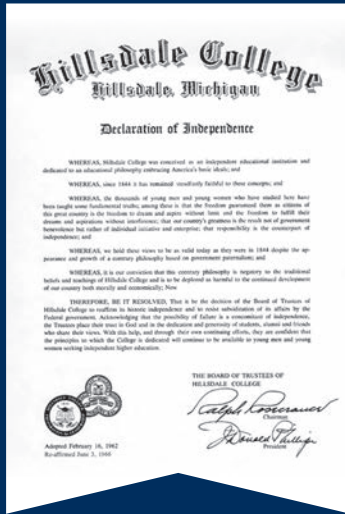
Hillsdale College's Declaration of Independence, adopted in 1962